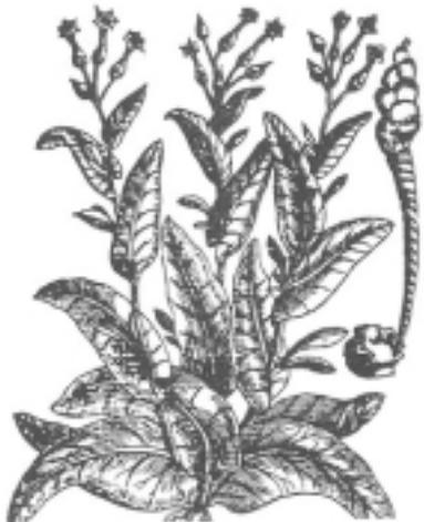
Fanciful Cigar, from l'Obel's NOVA STIRPIUM, Antwerp, 1576

But what about the use by Amerindians? Some groups use tobacco in rituals, smoking fat cigars as long as 100 cm (39") that require special supports. Others chew it or take it as snuff, individually or blown into one's nasal passages by others. Still, a paste obtained from the slow decoction of tobacco, called ambil in Amazonia, is rubbed onto the oral mucosa for rapid absorption, an early version of transdermal administration of a chemical. Tobacco juice, a potent potion, is drunk in rites of passage from puberty to manhood or the initiation of shaman's apprentices, the effect so powerful that it is described as "dying" and repeated many times during the rituals. One less known method of nicotine intake is by enema. You may be interested to learn that the South American Indians invented a syringe made of the hollow, long bone of a bird or a cane provided with a rubber bulb to apply enemas of various