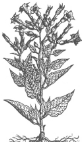
Lance Leaved Petum, from l'Ecluse's HISTO MEDICINAL, Antwerp, 1579

Some of you may have noticed that the last issue of AMIGOS did not include this section. The writer was on a holiday or, rather, suffered from a severe case of writer's block.