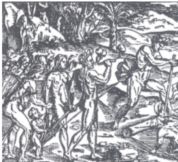
Smoking Indian, from Thevet's SINGULARITEZ, Paris, 1558

Tobacco was planted as a curious and wonderful medicinal plant, used for the bites of animals, headaches, colds, asthma, bruises, rheumatism, ulcers, apoplexy and even the plague. Herbals abound with the almost miraculous properties of Nicotiana , variously mentioned as “herba panacea,” cure-all herb, “herba sancta,” holy herb, “san sancta indorum”