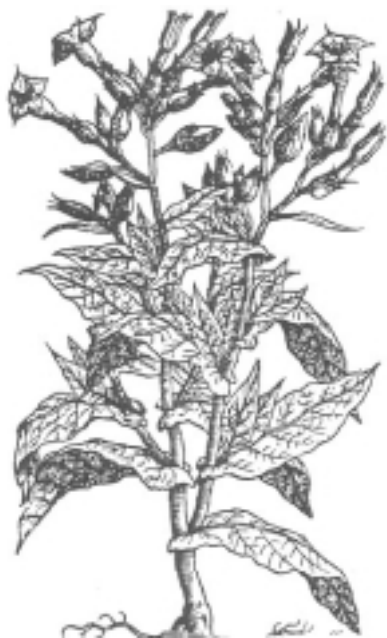
Broad Leaved Petum, from l'Ecluse's HISTO MEDICINAL, Antwerp, 1579

smokes, which are some dry herbs put in a certain leaf, dry also after the fashion of a musket (squib, or tube), lit at one end and at the other they chew or suck and take in with their breath that smoke which dulls their flesh and as it were intoxicates and so they say that they do not feel weariness. Those muskets, they call tobacos.” This is the account of tobacco smoking as recounted by Las Casas in 1527, freely embellishing upon the Admiral’s Journal.